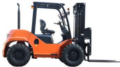
Min. 8.66in Ground Clearance