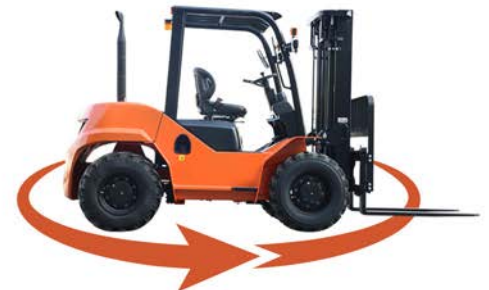
Turning Radius 121"